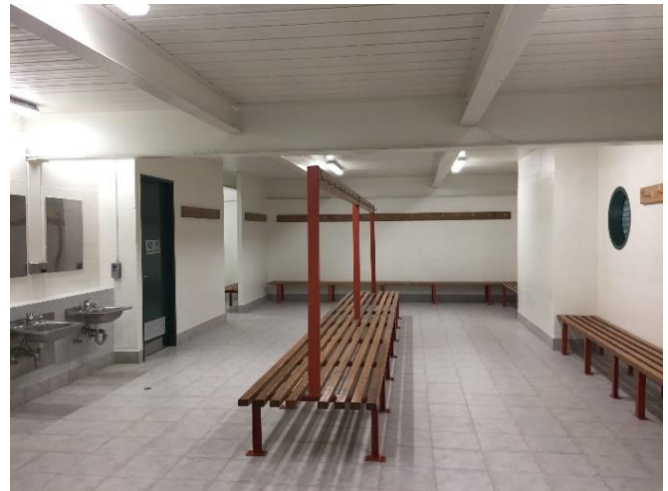
Figure 2: Freshly painted ladies change rooms in the rowing shed with new fittings, scrubbed tiles and repaired water leaks.

speed humps and sealing the main carpark, with line marking for general parking and event parking.