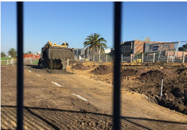
Figure 1: Constructing switchback at the western end of the path.

Weather permitting, the path is expected to be completed by mid-June.