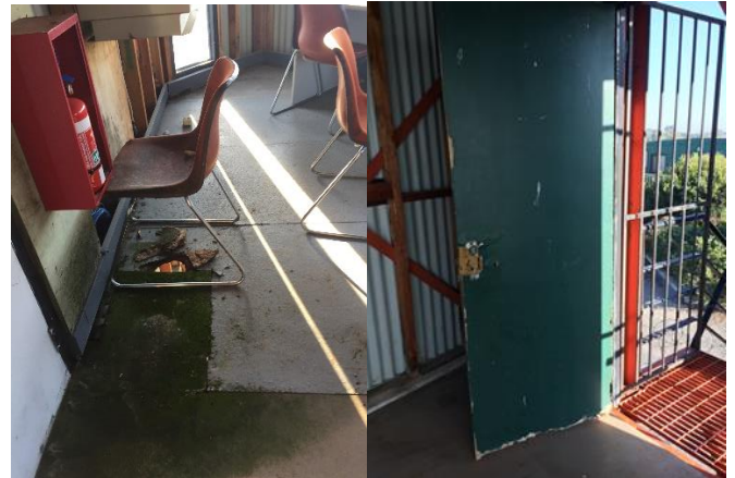
Figure 3: Some of the key repair items in the finish tower.

Discussions with Parks Victoria have identified the need to replace old fencing and bollards. Stakeholders will be consulted about this work before a fencing plan is drafted.