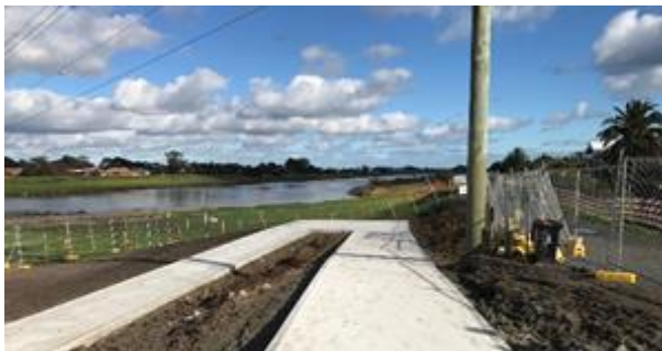
Figure 1: Constructing switchback at the western end of the path.

Works to construct the path are almost finished, with concrete laying nearing completion. Handrails will soon be added to the western end and ground cover planted around the switchback (see below). All work is expected to be completed by the end of June.