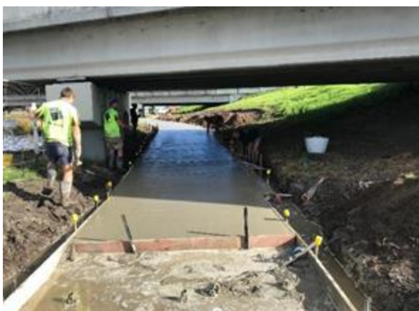
Figure 2: Laying concrete under Wells Road.